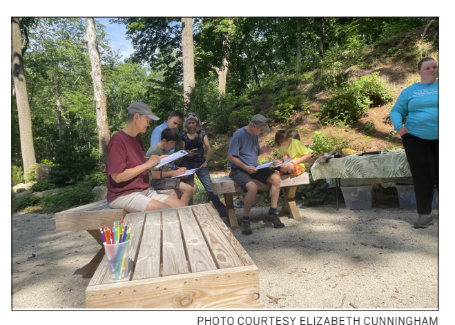
The Lenape session.

The West Chester Green Team continued their Legendary Lenape Summer Program at Historic Bondsville Mill Park and Gardens in Downingtown on July 15.