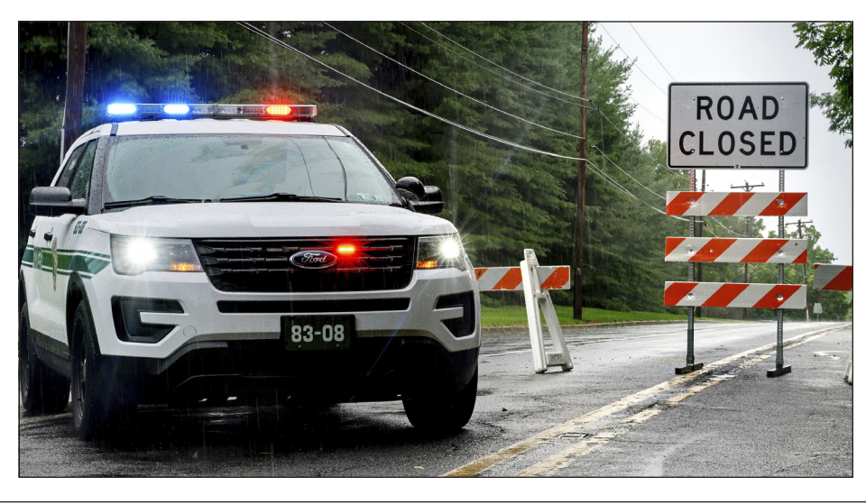
Stonebridge Crossing Road

The deaths and the search for the children of support, particularly in social media posts in the suburb about 35 miles (56 kilometers) north of Philadelphia. A community vigil for those affected is set for Thursday evening.